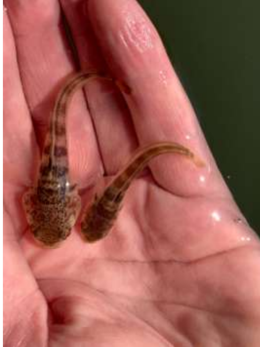
Plainfin Midshipman 1 October 2024 (I.M. Laursen)