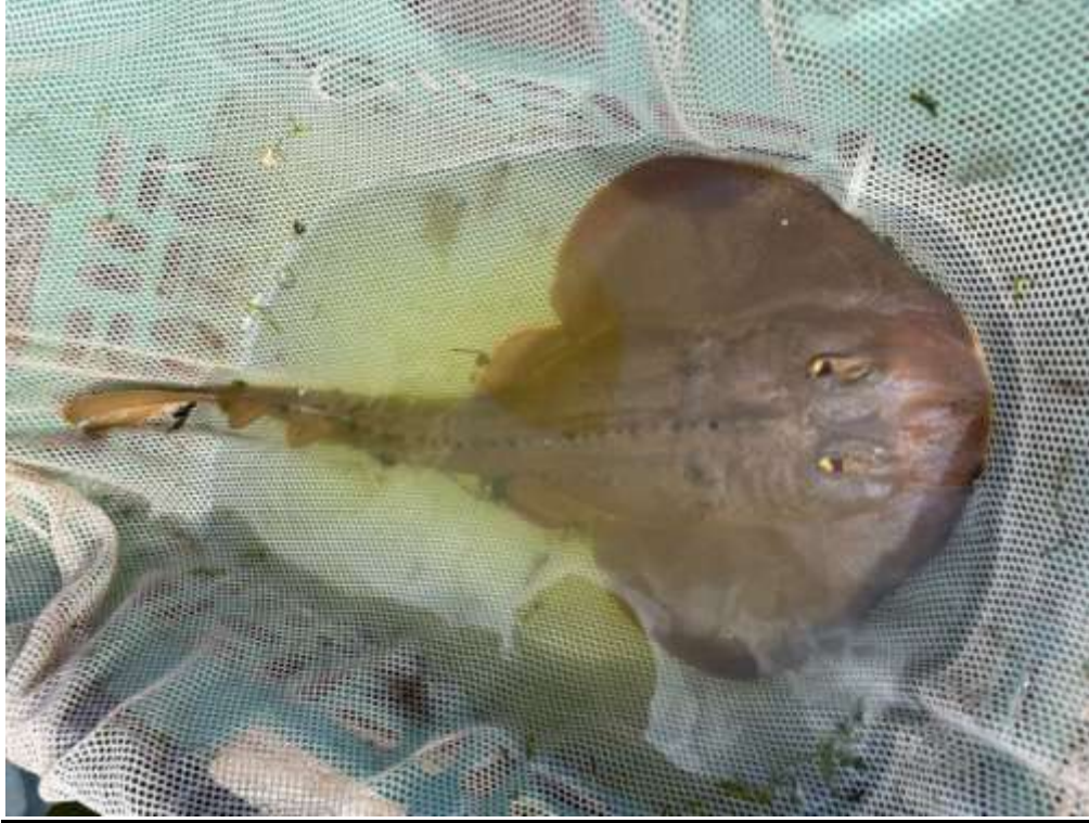
Thornback Guitarfish 1 October 2025 (C. Steiner)