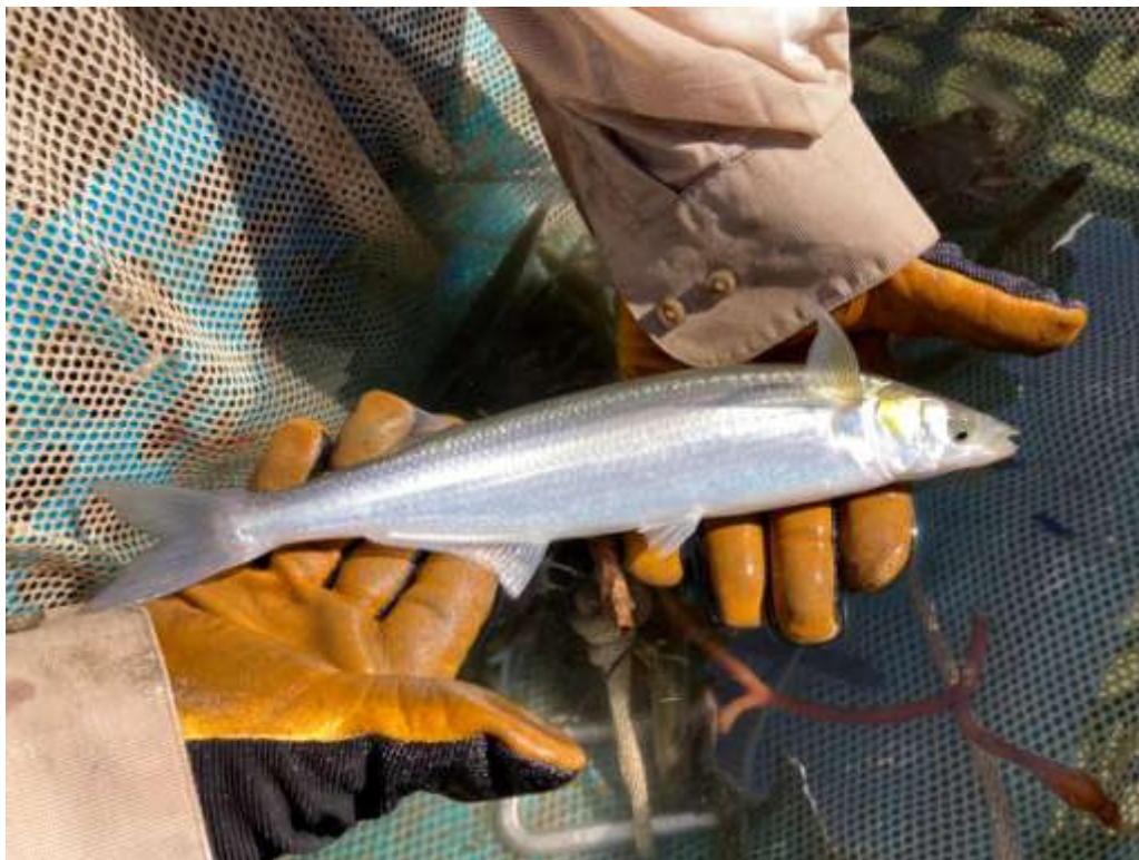
Jack Smelt 1 October 2024 (I.M. Laursen)