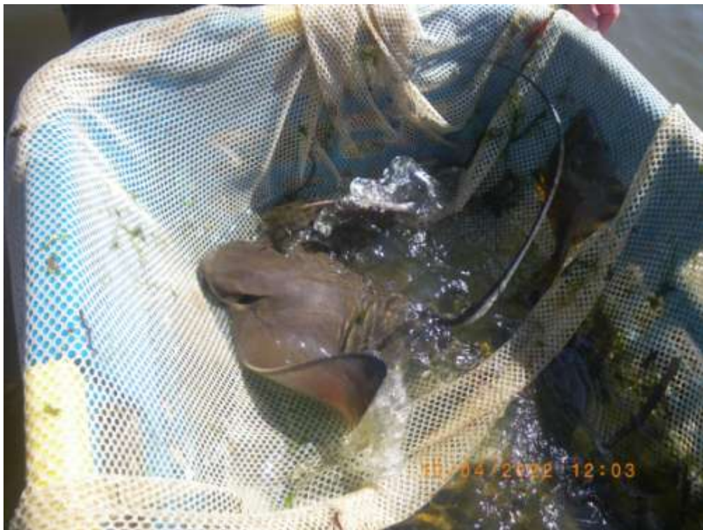
Bat Ray 4 October 2022 (D.W. Alley)