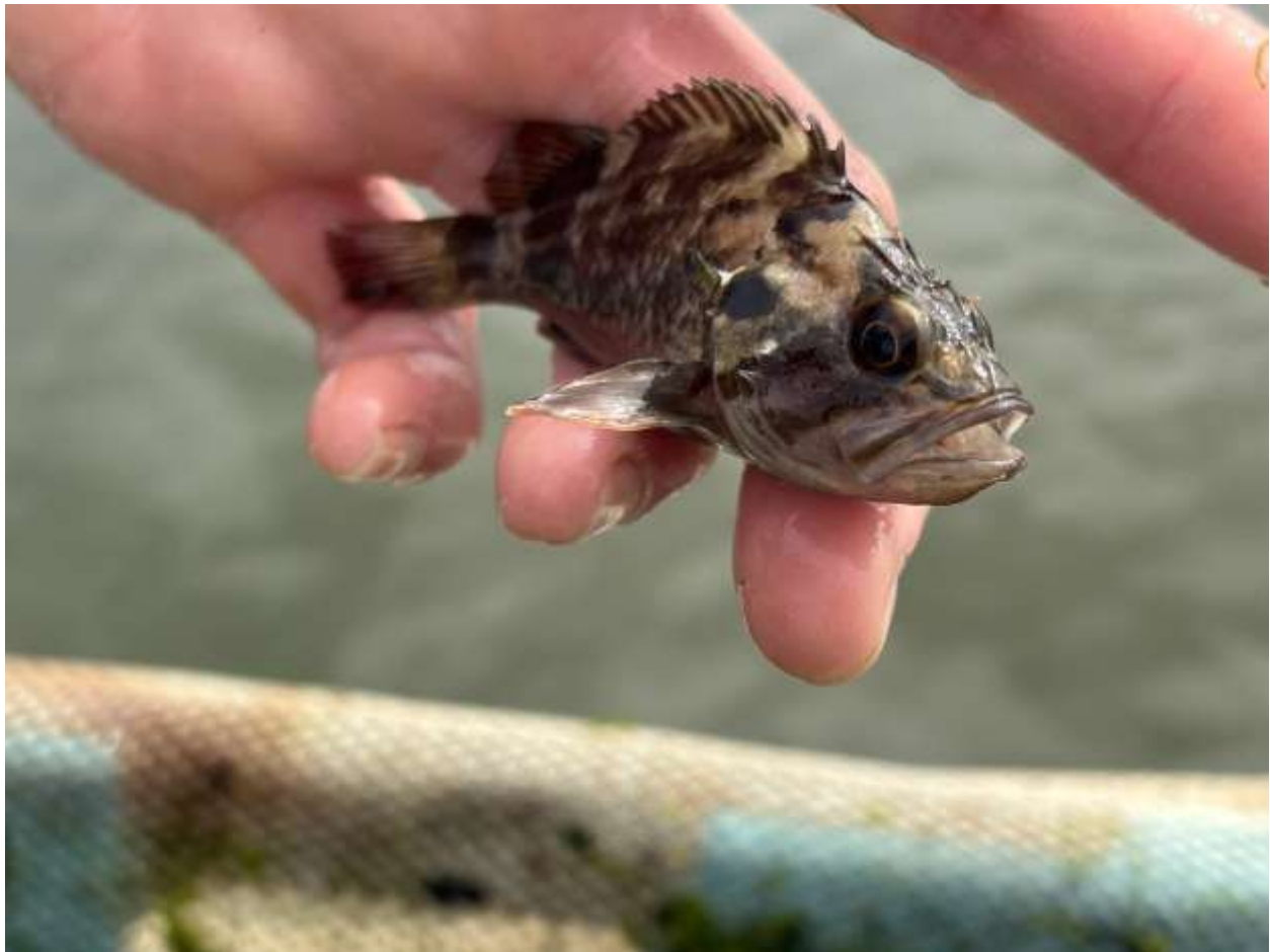
Black-and-Yellow Rockfish 1 October 2025 (I.M. Laursen)