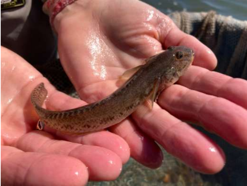
Longjaw Mudsucker 1 October 2024 (I.M. Laursen)