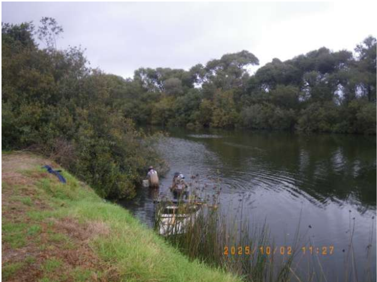
Upper Pajaro Estuary, looking upstream at sampling site, adjacent to the model airport. 2 October 2025 (D.W. Alley)