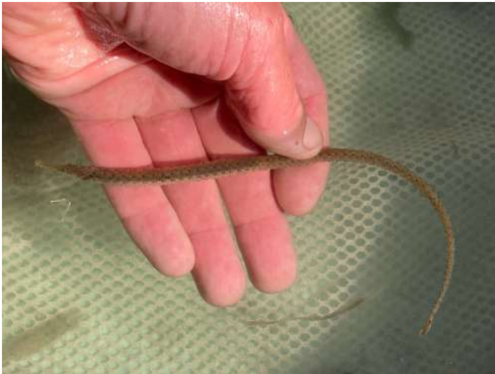
Kelp Pipefish 3 October 2023 (I.M. Laursen)