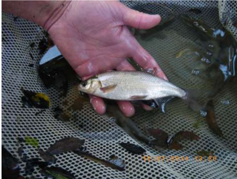
Native Hitch ( Lavinia exilicauda ) once common in Pajaro Lagoon in the 1960's, now rarely observed. 7 October 2014 (D.W. Alley)