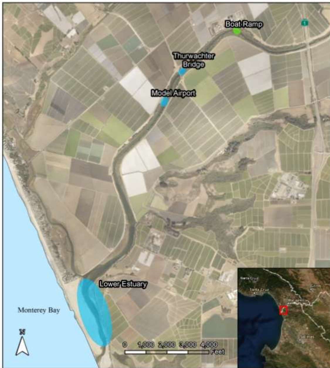
Figure 1. Pajaro Lagoon Fish and Water Quality Sampling Sites